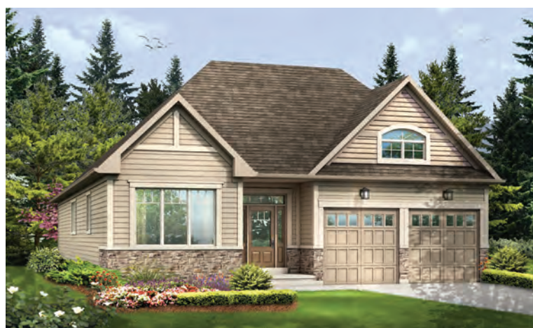
Elevation A – 1450 sq.ft.