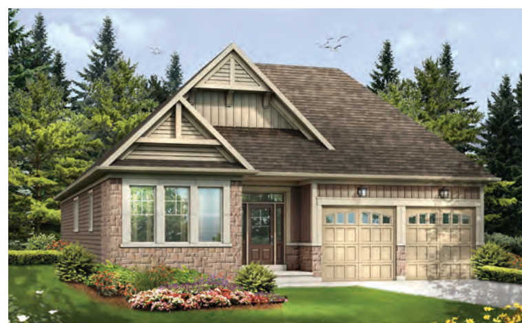
Elevation B – 1450 sq.ft.