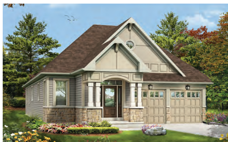
Elevation B – 1700 sq.ft.