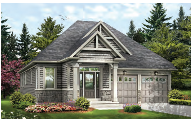
Elevation A – 1700 sq.ft.